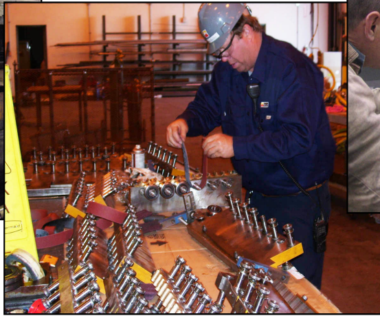
▲ Backup bearing change