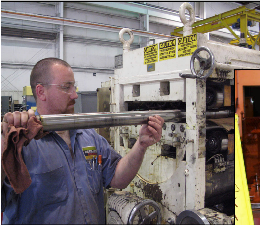
▲ Roll change